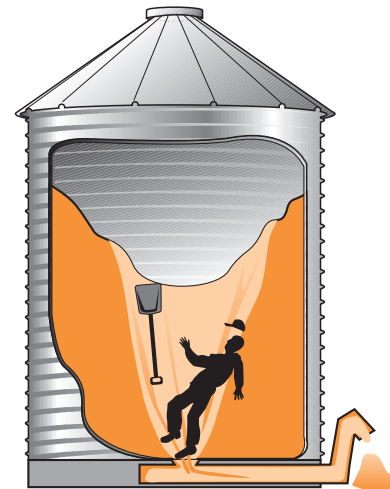
Figure 1. A center grain unloading auger draws grain from the top center and the grain forms a cone as the bin is emptied.

located in the center of the bin bottom, so the grain flows down the center. Speed increases as grain flows from the bin wall at the top of the grain mass into a small vertical column at the center of the bin. This vertical column of grain flows down through the grain mass at nearly the same rate as the grain is withdrawn from the bin.