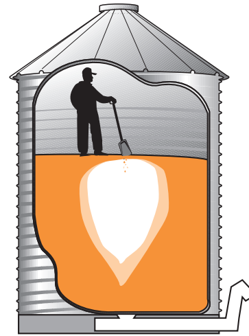
Figure 2. A potentially dangerous situation is created when grain spoils in storage and forms a crust on the surface. Removing grain will create a void if the crust remains intact.

Some grains such as flax or millet will not support a person's weight. Therefore, walking across the surface of these grains, or other unknown materials, without testing to determine whether they will